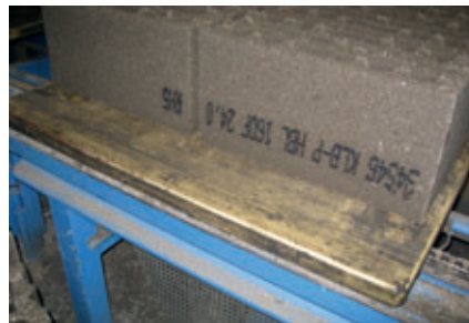
The Assyx DuroBoard® has been in demand worldwide for 10 years

The moods at the bauma in the years 2007, 2010 and 2013 also reflect the development of the Assyx Company very well. In 2007 the industry was in a good mood and Assyx was able to get off to a great start as a company.