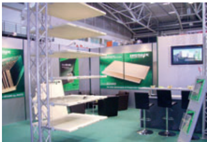
Assyx booth at the bauma 2007

Assyx is exhibiting at the bauma in Munich for the fourth time in a row and will present its Assyx DuroBoard® production board. In addition, the company founded in 2006 is celebrating its tenth anniversary.